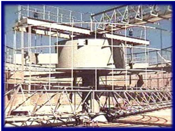
Scrapper assembly system in a clarifier